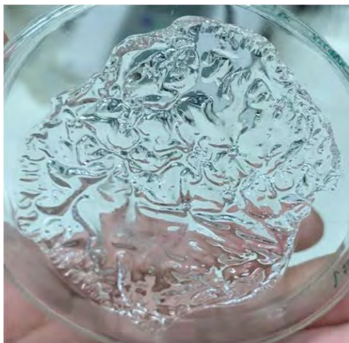
Striations on gel caused by rapid cooling and oxygenation of pre gel solution