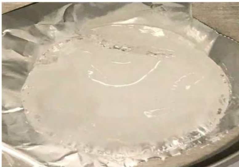
Partially disintegrated Freeze Thawed PVA gel