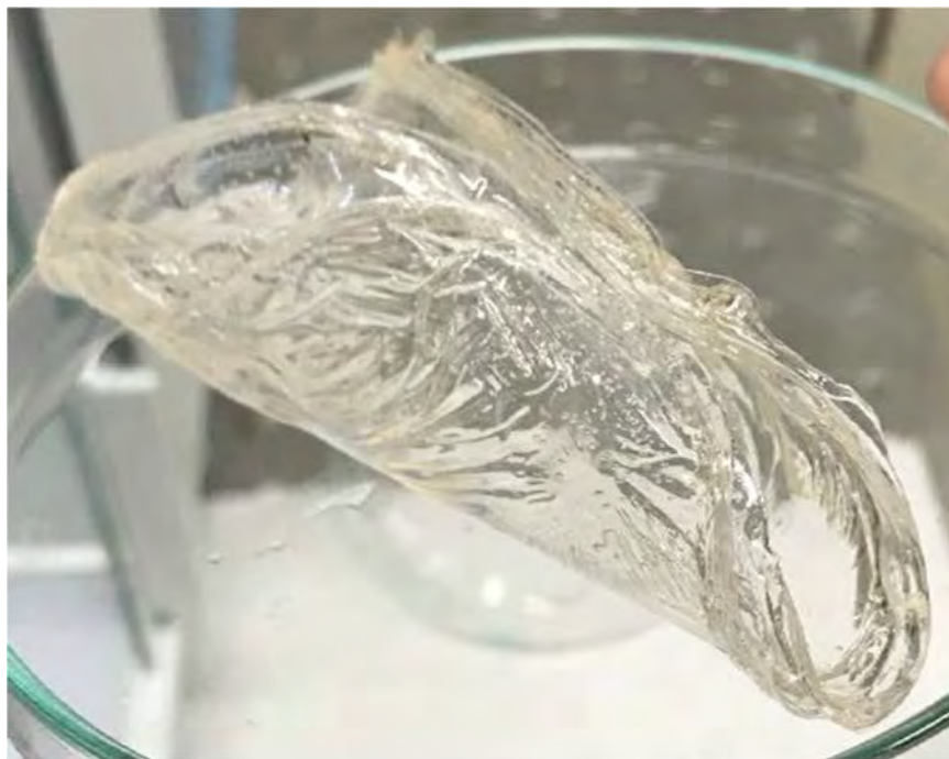
Semi-irreversible contracture of thick PVA hydrogel