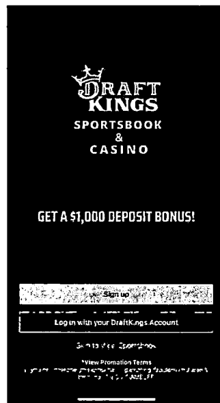
Figure 2 - Screen Capture of DraftKings iPhone App