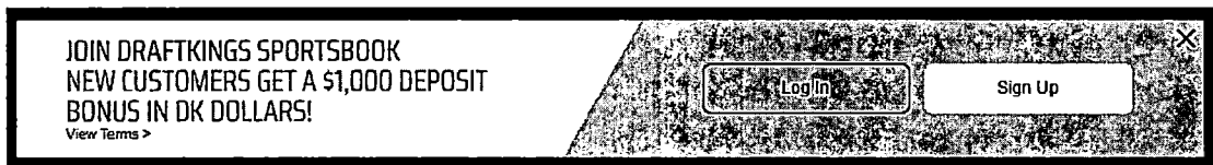
Figure 1- Screen Capture from DraftKings’ Website on 3/13/2023 via Wayback Machine: https://web.archive.org/web/20230313185638/https://sportsbook.draftkings.com/featured